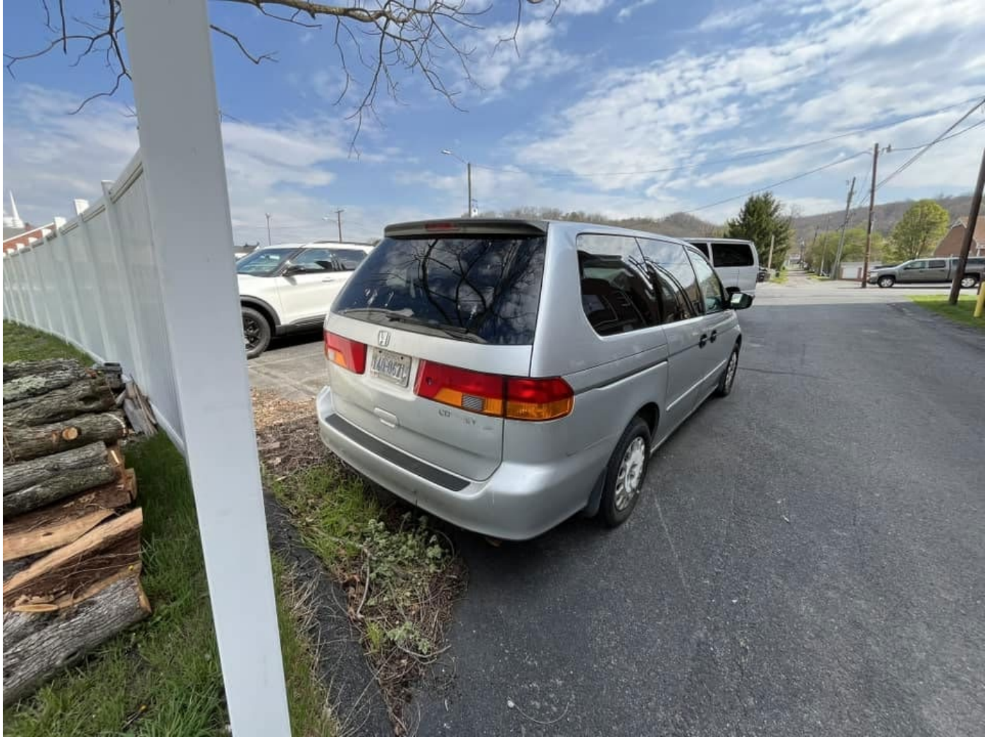
Honda Odyssey 2003 177,483 (Does Not Run)